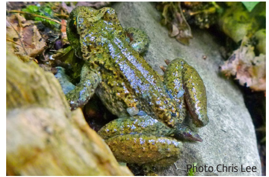
Tail (males only)