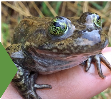
Eyes facing upwards