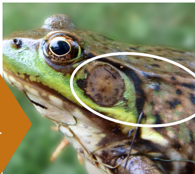
Ear drum & skin ridges