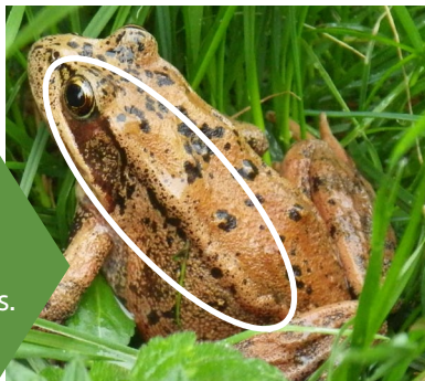
Skin ridges down back