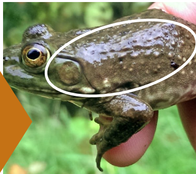
Ear drum & no skin ridges