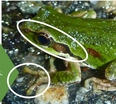
Toepads and eye mask